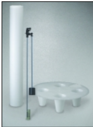
OPTIONAL 4" SLOTTED BRINE WELL, SAFETY BRINE VALVE ASSEMBLY AND SALT GRID